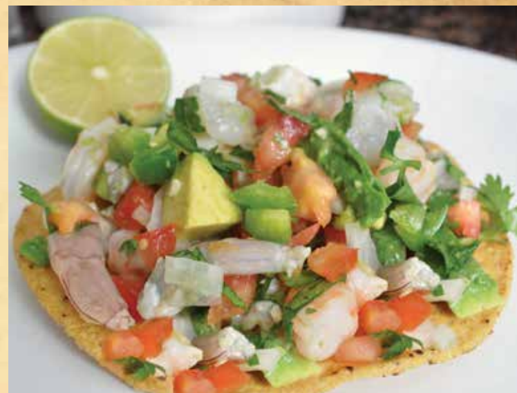
ceviche de camaron